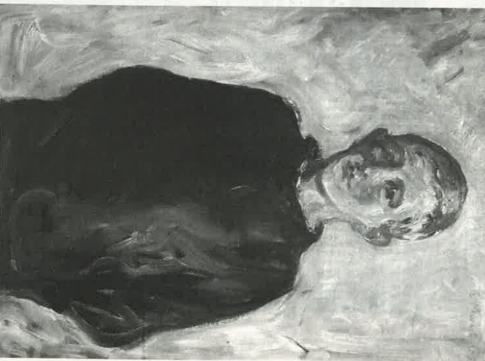
Edward Munch 'Gutt Fra Warremunde' (Boy from Warmunde) (1907) Oil on canvas