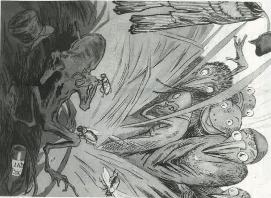
Theodore Kittelson 'Do Animals Have Souls?', illustration 1893

There is a presence throughout of the outstanding illustrator Theodore Kittelsen (1857-1914), whose imagination conjured up fairytales and eerie anthropomorphic animal dramas which define the folklore of Norway and are a part of the culture.